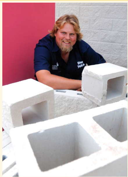
Photograph and story courtesy of The Gympie Times