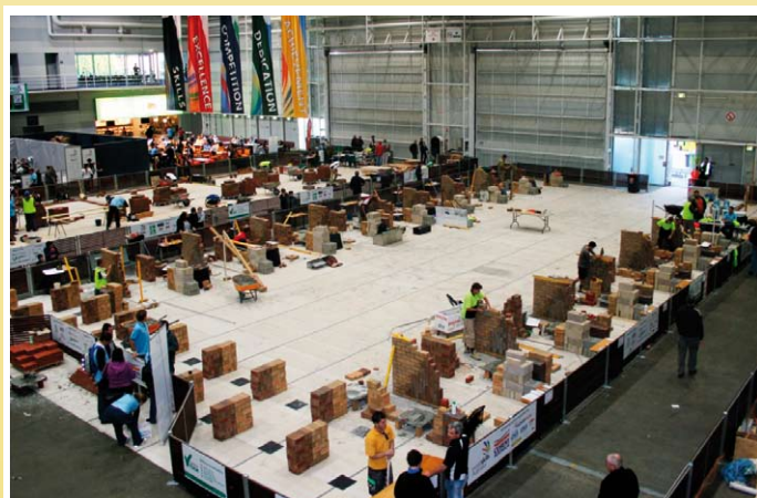
Bricklaying Competitors at WorldSkills held in Sydney in 2008