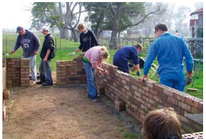
Step Out Program for grade 9 and 10 students at Exeter High School constructing a shade house on the school farm.

The program aims to give students a hands on experience to enable them to make an informed decision about starting in the trade. Some students were very keen and have already started an apprenticeship in bricklaying.