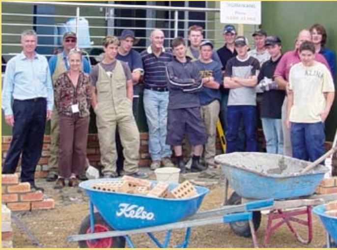
The first Step Out Program in Tasmania was run at Claremont High School.